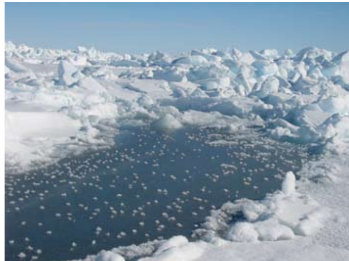
Antarctic sea ice and snow cover thickness can vary from a thin, smooth sheet of ice with no snow to ridges several meters thick with variable snow cover.

An open forum / evening session will be held during the Fall AGU meeting in San Francisco in December, 2007 to discuss the implementation of these recommendations. Details advised via the CliC website ( http://clic.npolar.no ) closer to the meeting. All welcome.