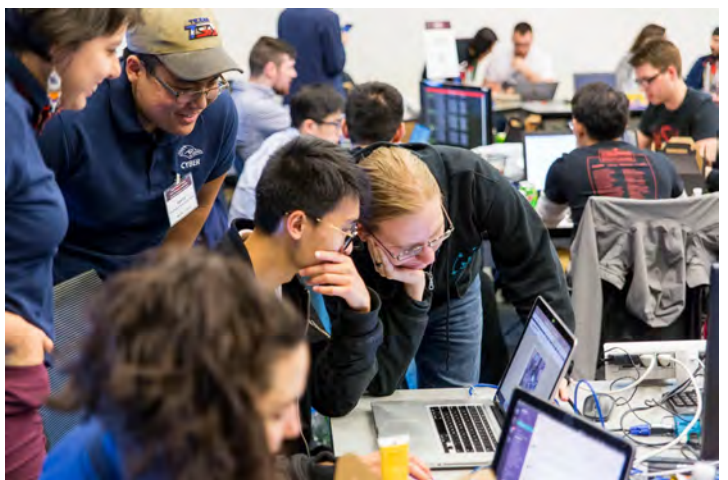
The Computer Security Association are looking at an interesting find at the 2018 Department of Energy and National Laboratories' Cyber Defense Competition.

These organizations host various events throughout the year, including but not limited to hackathon competitions, capture the flag cyber competitions, industry panels from invited speakers, volunteer opportunities, career prep, hands-on tech workshops, studying sessions, mentoring circles, networking events, and fun socials on and off-campus.