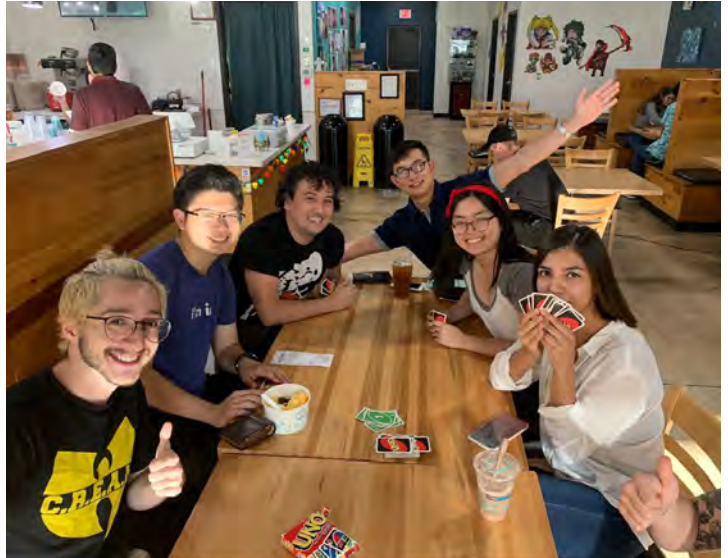
ACM members hosted an Ice Breaker Meet and Greet social to welcome new members after their first chapter meeting of the Fall 2019 semester.