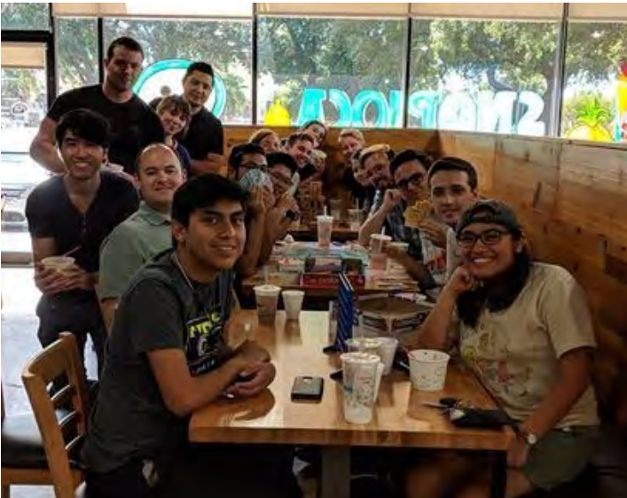
ACM members hosted an Ice Breaker Meet and Greet social to welcome new members after their first chapter meeting of the Fall 2018 semester.

UTSA has more than 330 student organizations on campus, giving its students have plenty of opportunities to connect with one another.